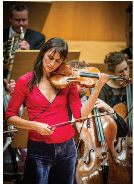
Viktoria Mullova performs Prokofiev's Second Violin Concerto