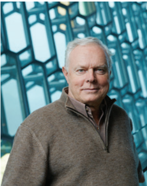
Yan Pascal Tortelier , Chief Conductor of the Iceland Symphony Orchestra

'Yeol Eum Son, a model of clarity and fleetness'